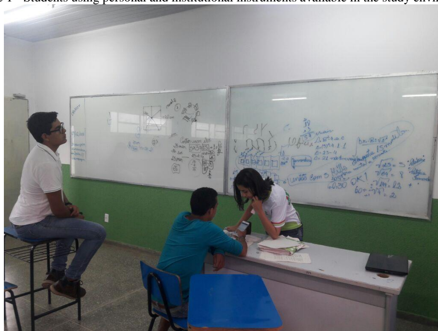
Figure 1 - Students using personal and institutional instruments available in the study environment